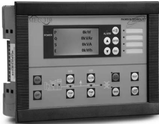
MEC 310 CONTROLLER